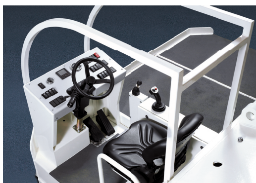
optional open driver's stand at rear