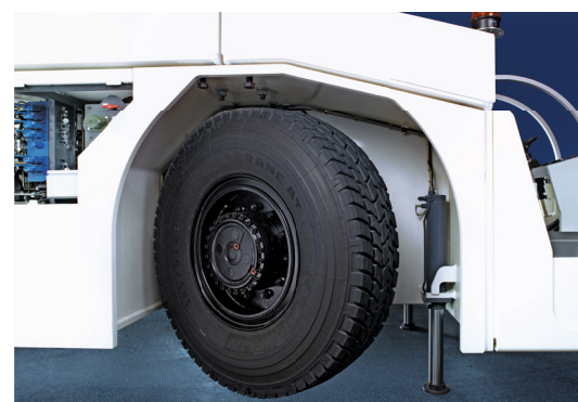
optional integrated hydraulic jacks